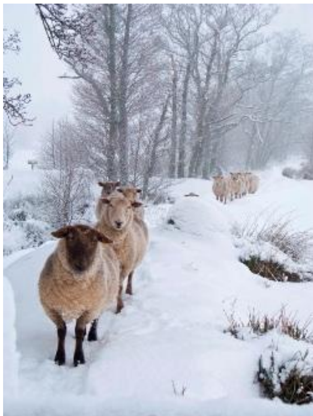
Snow Sheep

PS Remember to check the website for all the latest news: www.strachantoday.org